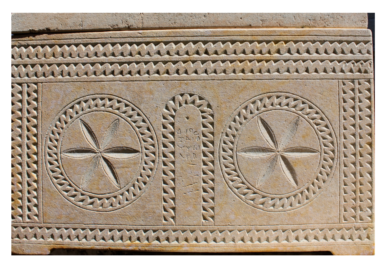
A precise replica of the face of ossuary 5 with the Greek inscription

Other than the Jewish followers of Jesus we know of no examples of Jonah as an iconic image among Jews in the late 2<sup>nd</sup> Temple period, nor is the story of Jonah related to the idea of resurrection of the dead. In contrast, followers of Jesus seize on the motif, relate it to Jesus' resurrection after three days, and it becomes the most ubiquitous funerary symbol for later Christians (Matthew 12:39-40 which is elaborated Q). Accordingly, we connect this unique symbolism, both in the image and the inscription, with Jonah, and thus with early followers of Jesus expressing their resurrection faith. We are convinced that its close proximity to tomb A, or the "Jesus family" tomb is thus significant and the two tombs are related both by their location on the same wealthy estate and their contents.